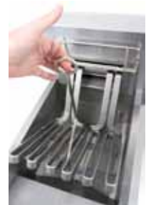
Combines swing-up elements with controlled burn-off cleaning (RE14 illustrated). Lift handle not available on 22 kw split pot element assembly.