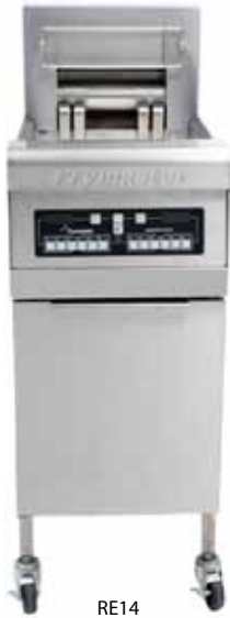
RE14 Shown with optional computer and casters